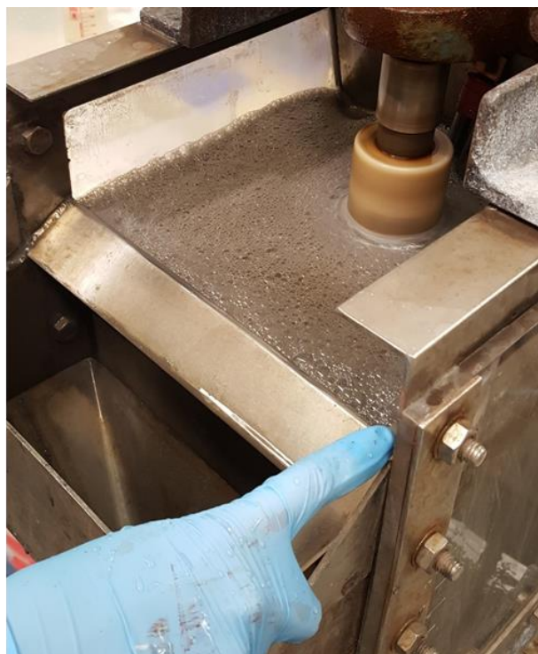
Figure 3: Zinc (Zn) rougher-cleaner flotation testwork – up to 58% Zn