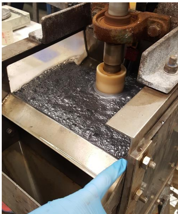
Figure 2: Lead (Pb) rougher-cleaner flotation testwork – up to 79% Pb

The independent testwork was undertaken by METS Engineering in Perth, Western Australia.